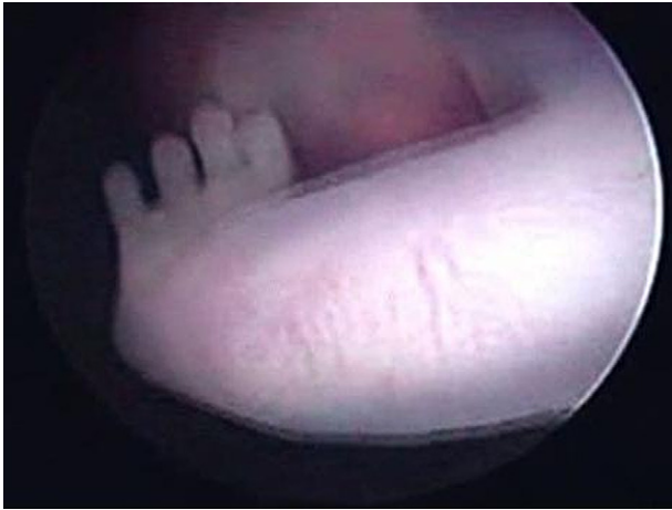
Fig. 4. Limb malformation in a 10-week embryo with syndactyly.

the chorion and amnion is performed with microscissors. A complete visualization of the embryo is recorded and analyzed. Cytogenetic analysis is taken directly from the demised embryo to avoid tissue contamination [3].