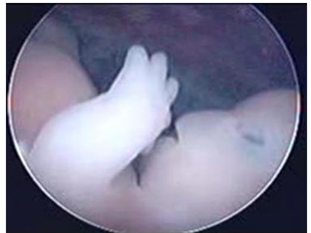
Fig. 2. Eight-week embryo with absence of nasal bone more common in trisomy 21.

Submitted January 25, 2009. Accepted for publication February 20, 2009. Available at www.sciencedirect.com and www.jmig.org