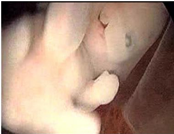
Fig. 1. Seven-week embryo with cleft lip.

The procedure is performed with the patient under general anesthesia and in the dorsolithotomy position, before obstetric curettage in patients with ultrasonographic diagnosis of fetal demise during the first trimester of pregnancy [2]. With a 5-mm 30-degree angle rigid hysteroscope and 0.9% normal saline solution, with pressures between 50 to 100 mm Hg, the vagina, cervical canal, uterus, tubal ostium, parietal decidua, and chorion are visualized. The opening of